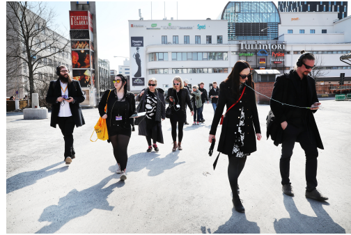
Figure 3. VUSAA -enhanced second soundwalking event during Tampere Biennale 2018.

We gathered feedback from the users in the form of notes taken during discussions following each presentation and during personal interviews. It seems that VUSAA is particularly successful in creating relationships among pre-existing